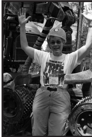
Teacher in the grips of a harvester

All tour travel and expenses are paid by a variety of generous sponsors. VIP treatment. 2 credits available. Explore beautiful forests, go on mill tours, network with educators, eat often and well! See the full-circle process of making products out of trees while sustaining forest ecosystems. To learn more and apply for a spot on the tour, visit www.idahoforests.org/tour.htm or contact IFPC at the PLT office. Based out of Lewiston. Application deadline, 3/ 31/08.