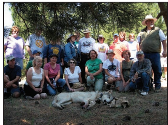
Teachers at 2007's Rangeland Ecology workshop with an anesthetized wolf being collared by the Nez Perce Tribe and USDA Wildlife Services.