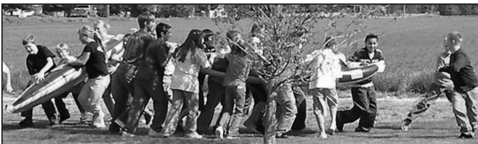
Idaho Falls students experience Water Awareness Week

June 18-19. PLT Hot Topics. Climate change and Idaho ecosystems. Boise. Learn from Idaho land managers and scientists. Grapple with the myriad challenges facing our ecosystems and the natural resources we depend on. Hours 8:30-4 each day.