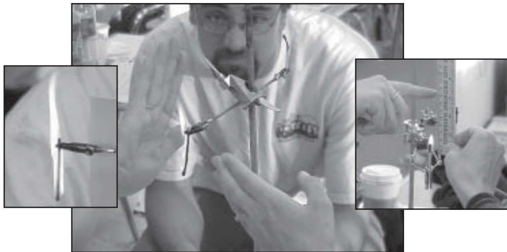
Teachers investigate the properties of fire at a PLT workshop

We've compiled information about opportunities for you to learn new things, have exciting adventures, and earn academic credit this summer. ( NOTE: Our spring one-credit workshops for Project's Learning Tree, WET and WILD are listed on the side-bar of page 2. Don't miss them! )