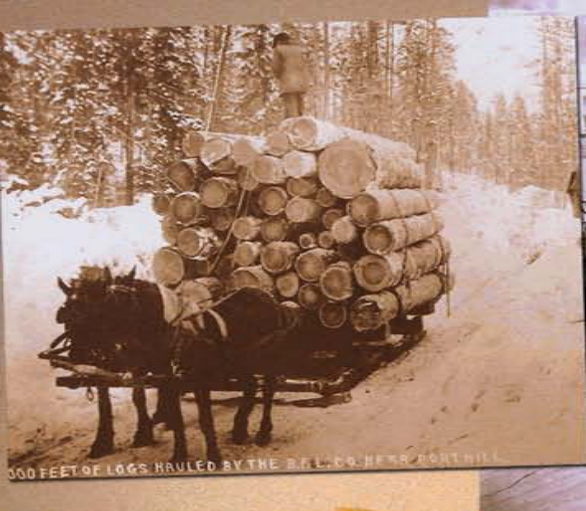
500 FEET OF LOGS HAULED BY THE BULLDOG BEHIND HILL